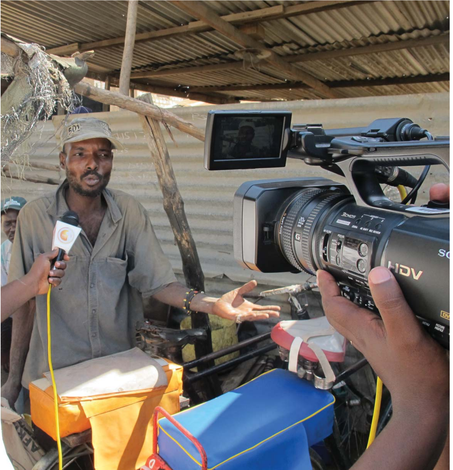
Election workshop, 2012 Mombasa residents sharing their expectations on the 2013 election with Free and Fair Media project trainees