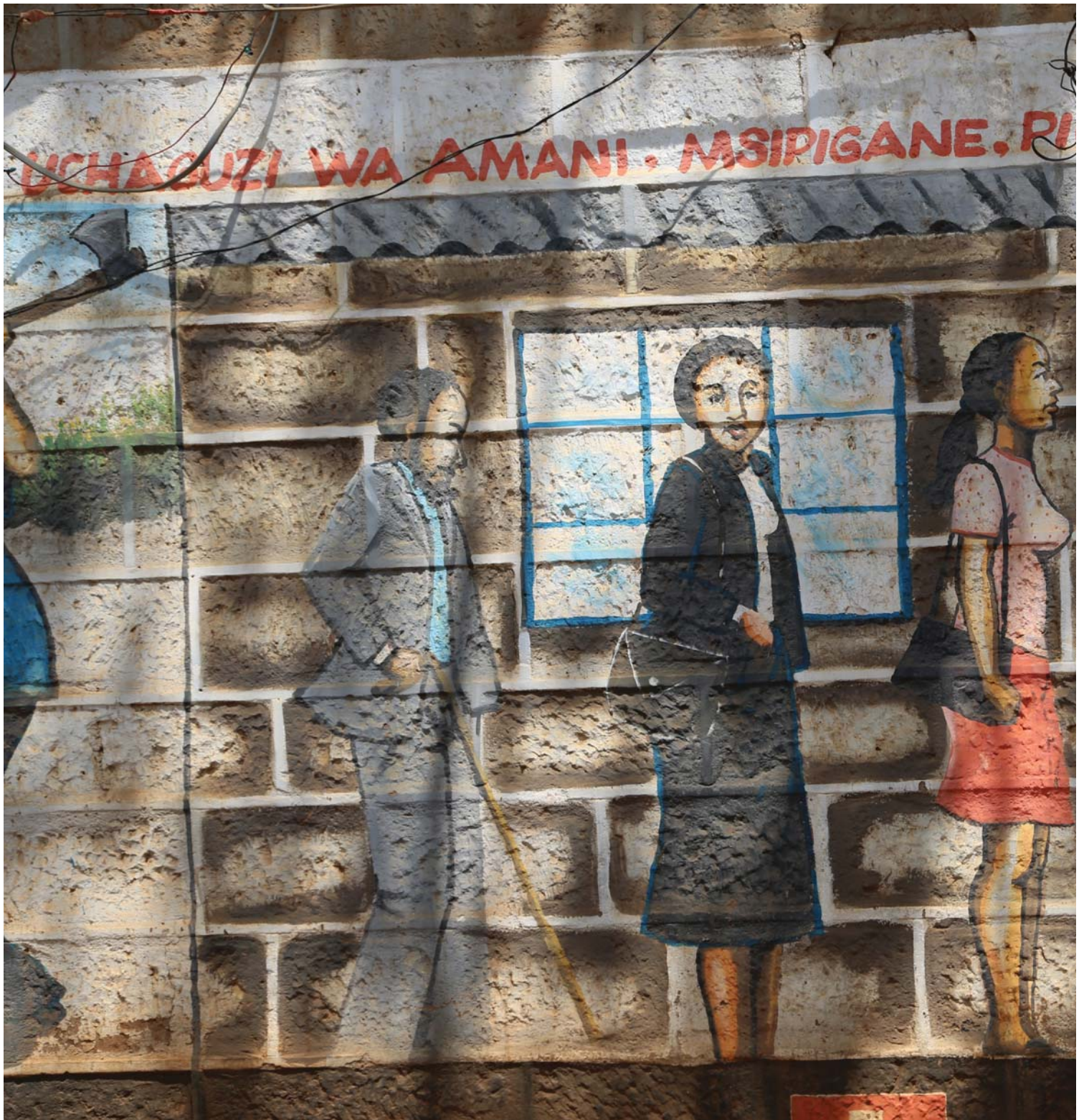
Election artwork in Kibera, Nairobi, 2012