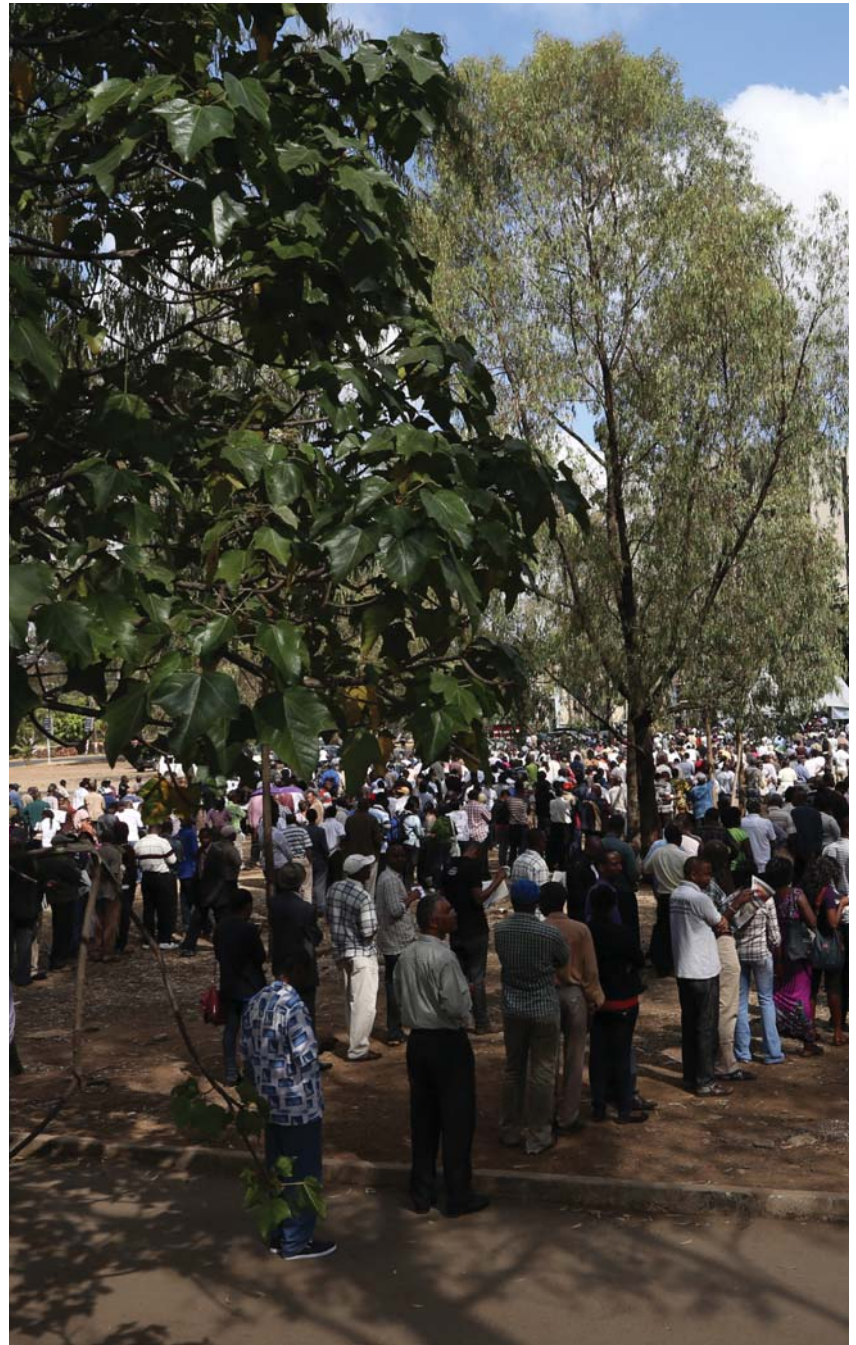
High turnout, 2013

Kofi Annan also added his voice to the praise. In a statement, on behalf of the African Union Panel of Eminent African Personalities, he wrote: "Let me also highlight the positive role that has been played by the media, in educating the public, promoting peace and exercising good judgment in their elections