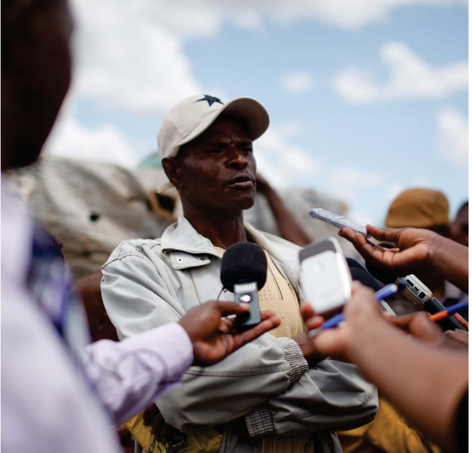
Field mentoring, 2012 Journalists interviewing post election violence victims in an Eldoret IDP camp