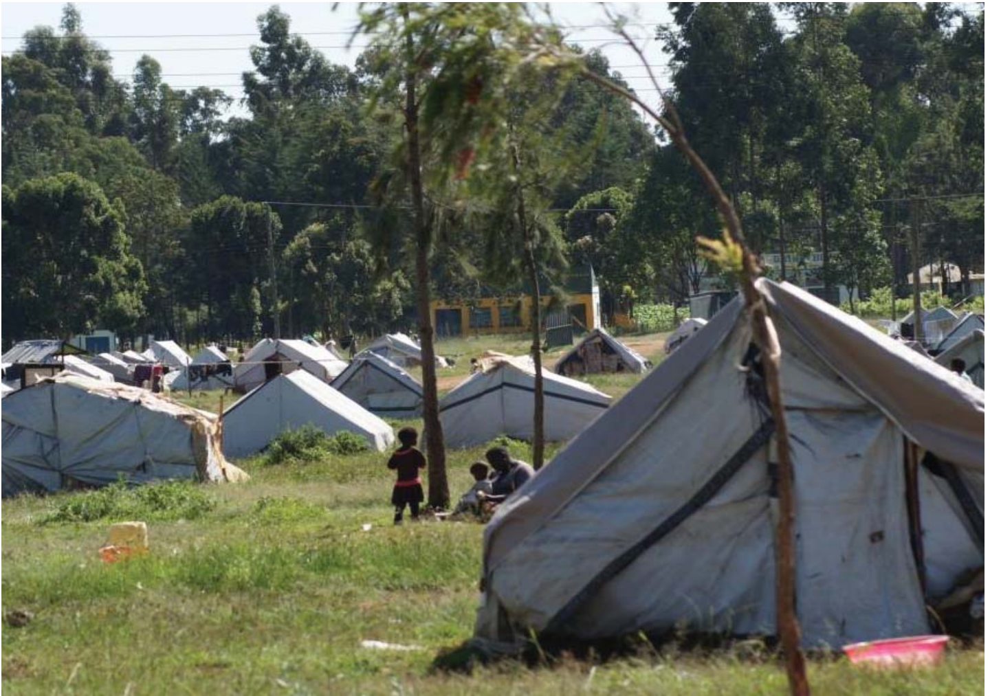
Children at Eldoret showground, 2009

With hindsight, perhaps the level of violence and intensity of the conflict that stunned Kenyans and the rest of the world should not have come as a complete shock, given the deep fissures in Kenya's political terrain. What was true however was that the last few days of 2007 would cast a long shadow over Kenya's media – one that would reach all the way to the 2013 election and beyond.