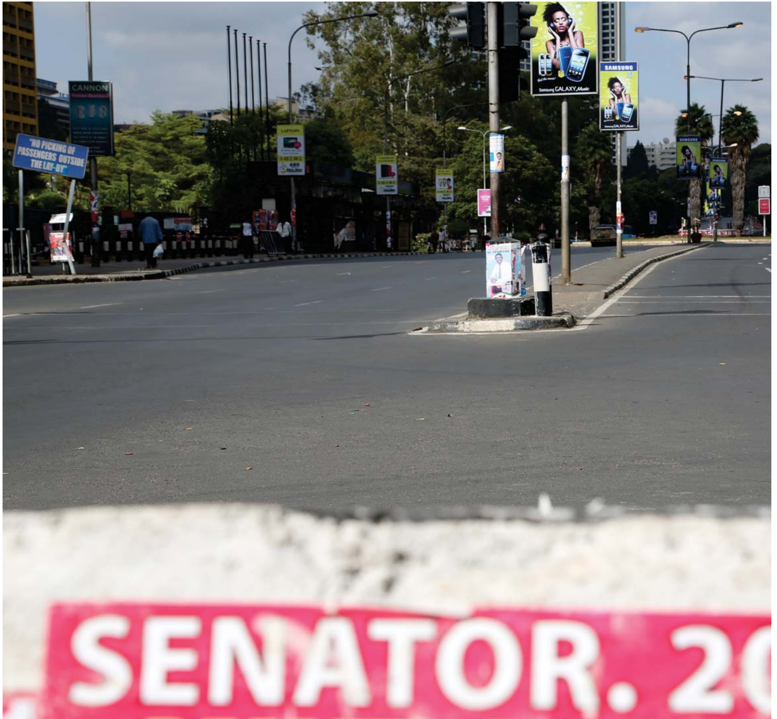
Election day, 2013 Nairobi's Central Business District streets are empty on voting day, March 4, 2013