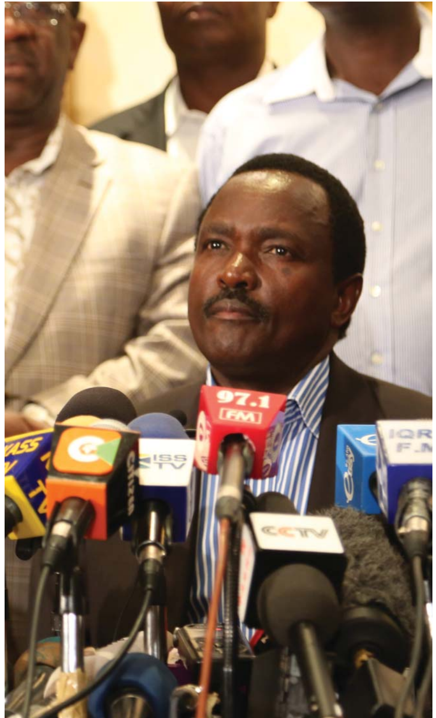
Press conference, 2013