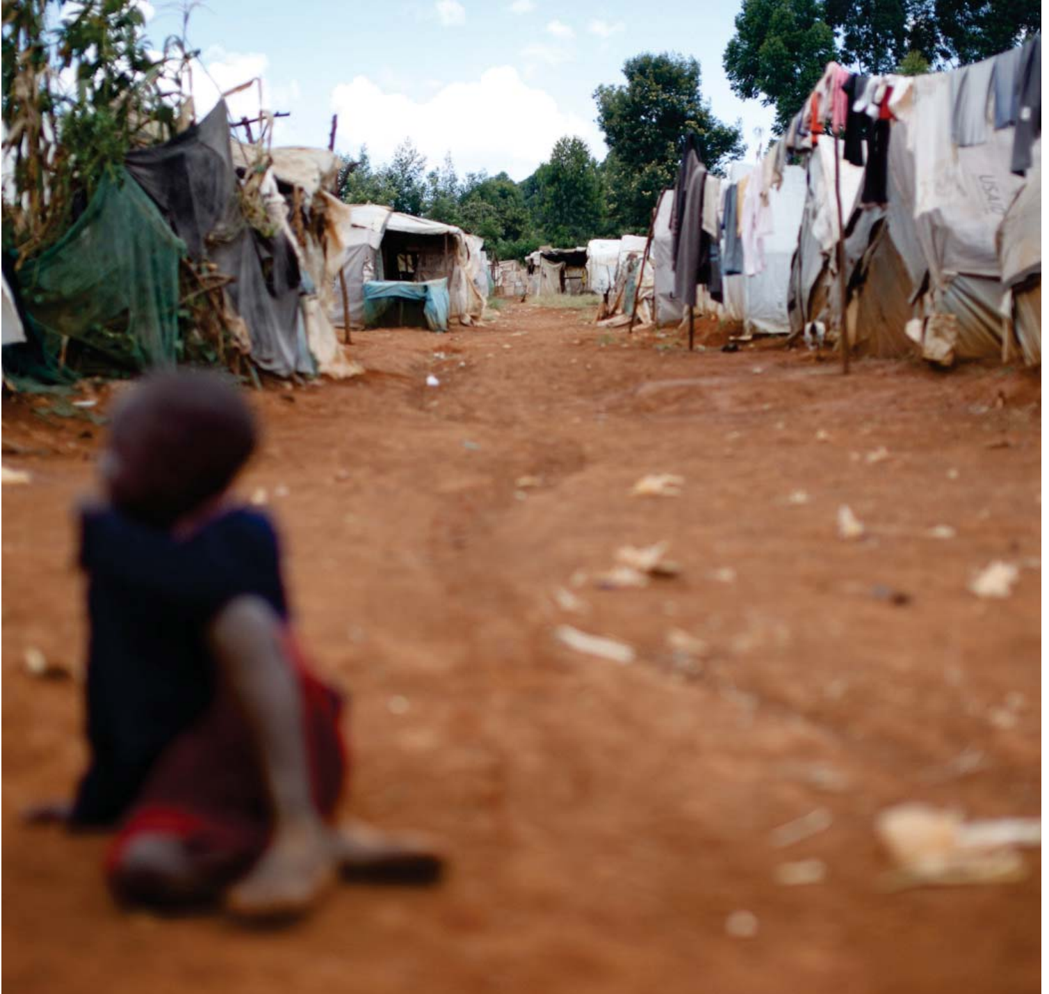
Child displaced by post-election violence, 2012